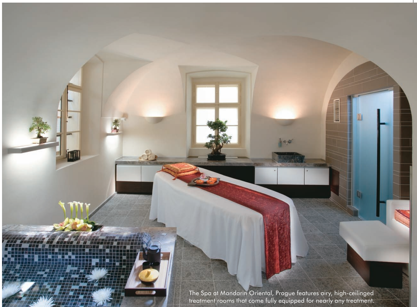
The Spa at Mandarin Oriental, Prague features airy, high-ceilinged treatment rooms that come fully equipped for nearly any treatment.

The private spa elevator deposits guests at the end of a long hallway, where each side is lined with Czech antiquities and artifacts providing a rich flavor of the city's culture and heritage. At the end of the hallway, inside the spa, all dank associations to basements are banished. The reception area is open, bright, high-ceilinged and spacious.