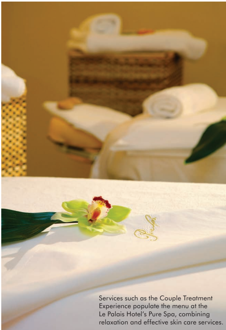
Services such as the Couple Treatment Experience populate the menu at the Le Palais Hotel's Pure Spa, combining relaxation and effective skin care services.

THE MOST IMPRESSIVE ASPECT OF THE MANDARIN ORIENTAL, PRAGUE SPA WAS THE SKILLFUL BLENDING OF THE HISTORICAL AND CULTURAL COMPONENTS OF THE CITY WITH A HIGHLY EFFECTIVE AND LUXURIOUS MODERN SPA EXPERIENCE.